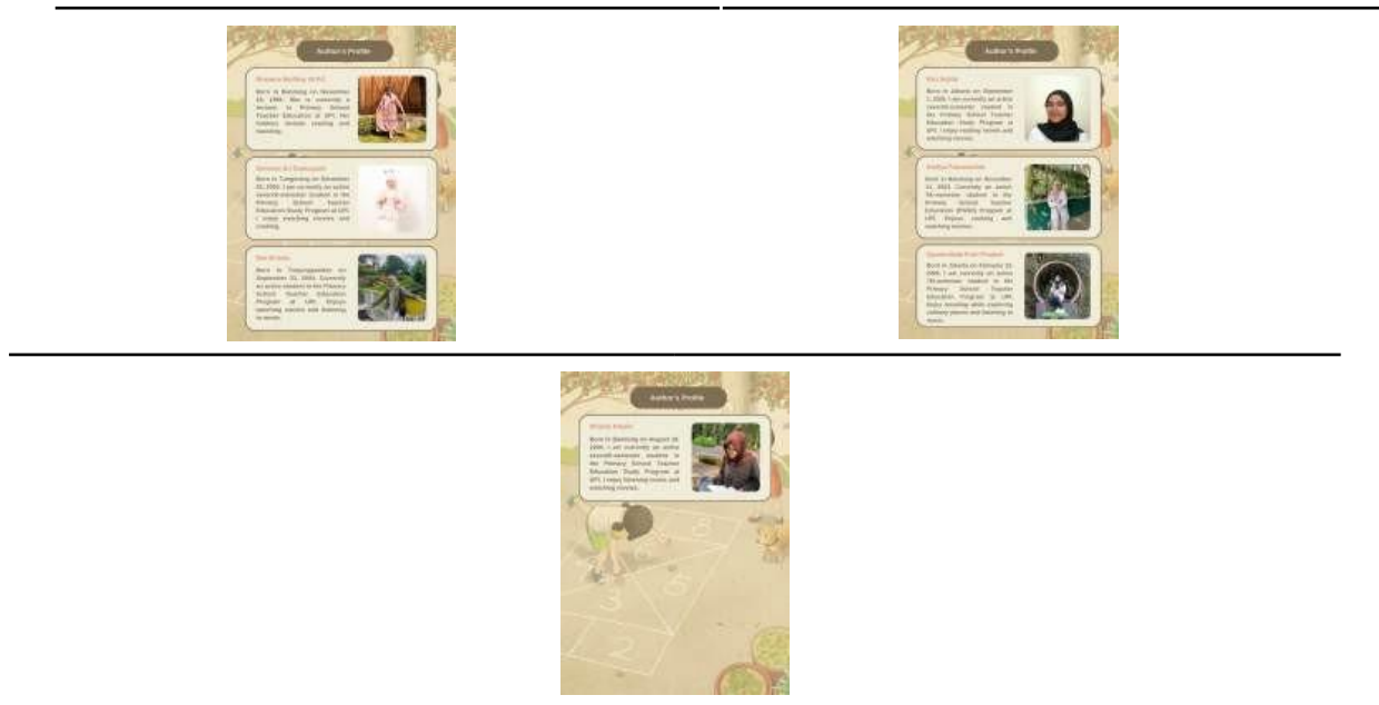
Table 7. Author's profile

Table 7 describes the profile introduction of the developer of the student worksheet. The worksheet was then validated by experts to ensure its quality and effectiveness before implementation. The validation process involved material experts, media experts, and learning experts. The validation results showed that the worksheet was categorized as highly feasible, as shown in Table 8.