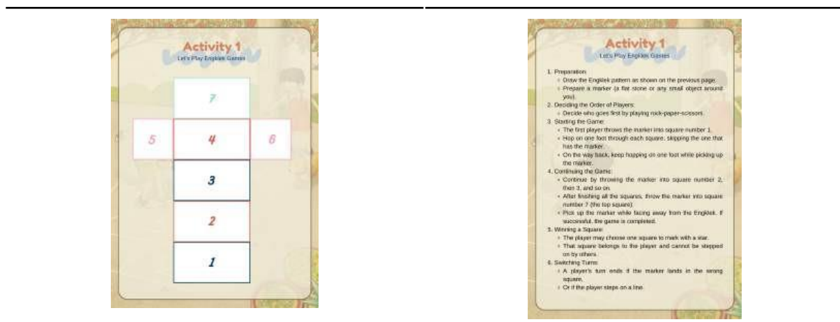
Table 5. Steps in the Engklek Game

Table 4, illustrates the design layout of the student worksheet, which includes the student's identity section, learning outcomes, learning objectives, instructions for completion, as well as the tools and materials required for the engklek game.