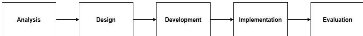
Figure 1. The Stages of the ADDIE Model

model (Analysis, Design, Development, Implementation, Evaluation). The ADDIE model is one of the systematic instructional design frameworks developed in a structured and programmed manner through a sequence of stages aimed at solving learning problems related to learning resources that align with students' needs and characteristics (Tegeh & Kirna, 2013). This model is visually illustrated in Figure 1.