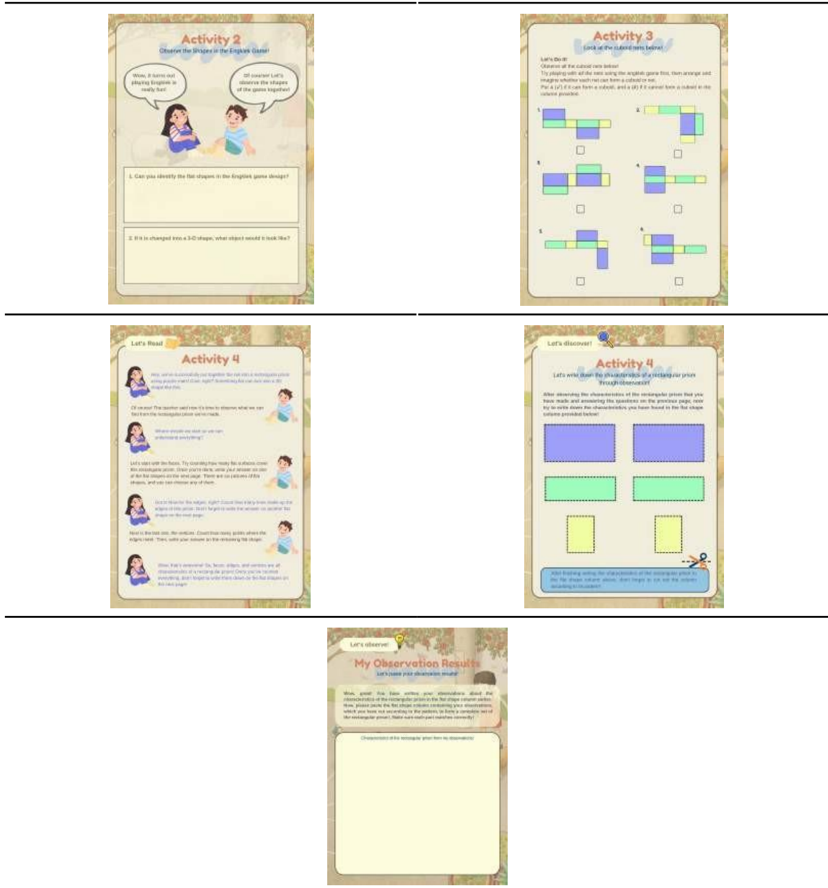
Table 6. Learning Activities in the Student Worksheet

Table 6 describes the students' learning activities while completing the student worksheet. The activities begin with identifying various plane shapes found in the engklek game pattern, followed by recognizing different types of cuboid nets and distinguishing those that do not form a cuboid. Finally, students are expected to identify