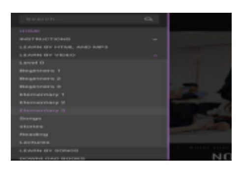
Figure 1.2 Display Menu Leran By Video Arabic Teacher Learning

In the next screen, students will be directed to open videos based on their level of understanding and learning, where in this case the lecturer chooses to study the bio page of Elementary 3 or the highest level on this Arabic teacher media, due to because those who use the video are semester 1 students majoring in Islamic Religious Education in Arabic Language Course at STAI Auliaurrasyidin Tembilahan.