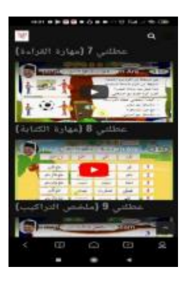
Figure 1.3 Video Display of Maharah Lughawiyah Arabic Teacher Learning

After the lecturer explains the steps that must be taken by students in using the Arabic Teacher media, the lecturer invites students to open the learning materials presented in the form of videos based on the respective categories of the four maharah. As shown in the following picture: