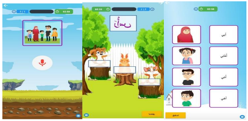
Figure 5: types of tests