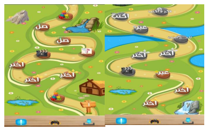
Figure 3: choice of material in the MiSK app

complete, this application will immediately direct us to the following available options menu: