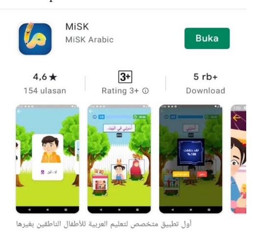
Figure 2: MiSK application in Google playstore

Open the google play store application and download the MiSK application, wait until the download process is complete