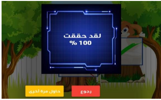
Figure 6: The answer score

Behind the convenience and sophistication of existing technology, there are many choices in the application of the learning process. In this case, the MiSK application can be an alternative media that can be used in the Arabic learning process. However, it does not escape from its advantages and disadvantages in its use. The advantages of the MiSK application are 1) Free, an application that can be downloaded for free on their respective androids and without a subscription fee, 2) Efficient, does not require a special time and place in its application, 3) diverse themes, with many themes provided so that users do not feel bored, 4) each material studied is equipped with exercises to measure students' ability to understand the material, 5) the material provided includes four language skills,