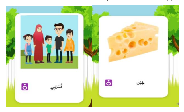
Figure 4: examples of learning materials

3. Choose the Alif section to listen the material provided in the application