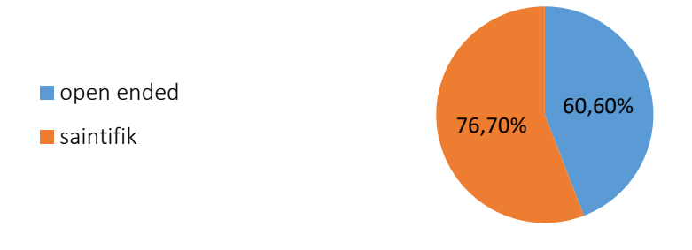
Diagram 1. Comparison of Open-ended and scientific approaches

The R-squared value of the open-ended approach was 0.606, meaning that the open-ended approach affect may student's mathematical connection skills by 60.6%. Meanwhile, the r-squared value of the scientific approach was 0.767, meaning that the scientific approach may affect student's mathematical connection skills by 76.7%. Thus, in this study, the scientific approach exhibited a more significant effect on students' mathematical connection skills than the