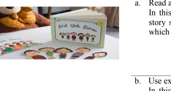
Table 2. The consept of reading a book

d. Introducing the characters in the story For instance, (explaining the six characters in the book which are A, I, U, E, O, Dad, and Mom with explaining the characteristics of their bodies, suit colors, and pants, hairs, and skin colors.