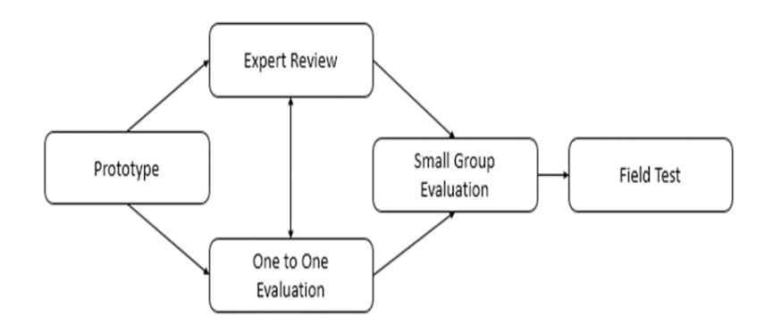
Figure 2. Formative Evaluation

the infamous Dick & Carrey (2001) method.