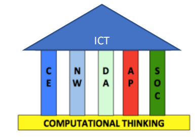
Figure 1. ICT, Informatics, & CT Correlations

CT in short is thinking like computer scientist. CT is a way of approaching everyday situations and solving problems by utilizing concepts that are fundamental to computer science (Flórez, 2017). As a computer scientist, you need to solve the problem logically by using algorithmic also using computing tools to quickly create modeling and data visualization. Information and communication technology (ICT) had 5 informatics pillars that consist of computer engineering, network, data analysis, algorithm and programming, social of computing. The foundation of those 5 pillars are computational thinking (Liem, 2018), as illustrated on figure 1.