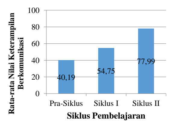
Figure 4.2. Scores Comparison Communication Skills Pre-Cycle, Cycle I and Cycle II.