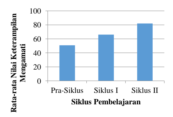
Figure 4.1. Scores Comparison Viewing Skills Pre-Cycle, Cycle I and Cycle II

outcomes ranging from Pre-Cycle, Cycle I and Cycle II. Results Pre-Cycle show class observing skills X8 are in the unfavorable category with a score of 50.79%. I cycle observing skills scores increased by 15.32% to 66.11% in the category quite well. Research targets are achieved in the second cycle, the score has increased by 31.18% to 81.97% in both categories. This shows that the treatment through the implementation of Problem Based Instruction able to improve their skills in the classroom observing Kebakkramat SMA X8. comparison of the results observing skills acquired between stages Pre-Cycle, Cycle I and Cycle II is presented in Figure 4.1.