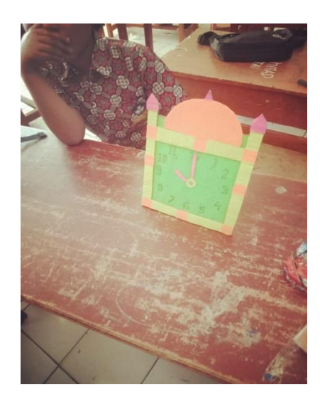
Figure 3. Student Craft Results from Waste 3