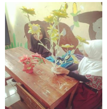
Figure 1. Student Craft Results from Waste 1

3) In the realm of creating, students are faced with challenges to design, design, then create a work from selected plastic waste materials. In this realm, students should be able to pour the broadest possible creative mind, so as to create optimal and more valuable work.