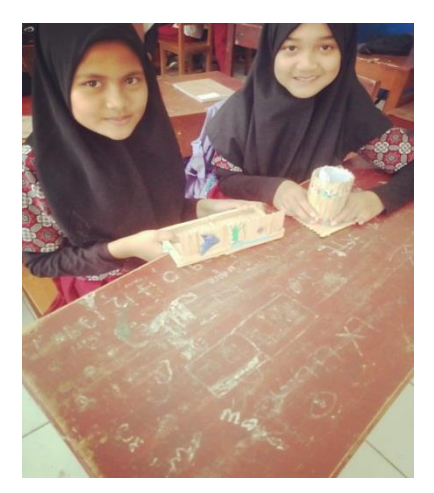
Figure 4. Student Craft Results from Waste 4