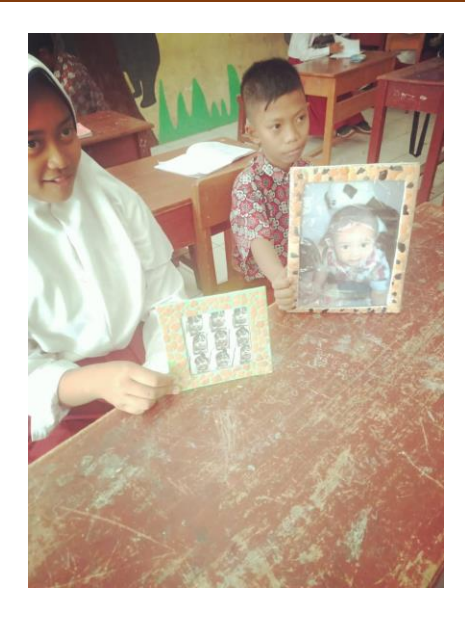
Figure 2. Student Craft Results from Waste 2