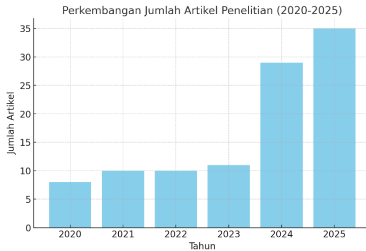
Diagram of Articles: Bibliomatrix of Digital Economic Transformation and Macroeconomic Competitiveness

The bar chart above illustrates the development of article publications each year from 2020 to 2025. As seen, there is a clear upward trend year after year, with a significant surge in 2025, reflecting consistent and increasing growth in publications related to this research topic. This chart provides a strong visual representation of the importance of this topic in academic research over the years.