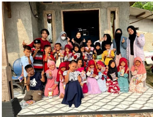
Figure 4. Final Documentation

In figure 3, the child is trying to answer a simple quiz contained in the PPT, the researcher included 3 simple quiz slides about the typical food of the Baduy tribe, musical instruments of the Badur tribe, and typical clothing of the Baduy tribe. The reason the researcher chose these three things was because the researcher showed pictures so that children could easily remember and answer the quiz.