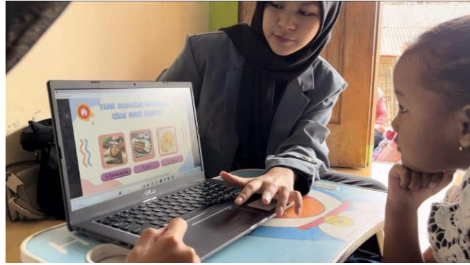
Figure 3: Children Play the Quiz Contained in The PPT

In figure 3, the child is trying to answer a simple quiz contained in the PPT, the researcher included 3 simple quiz slides about the typical food of the Baduy tribe, musical instruments of the Badur tribe, and typical clothing of the Baduy tribe. The reason the researcher chose these three things was because the researcher showed pictures so that children could easily remember and answer the quiz.