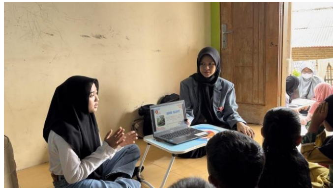
Figure 1. Opening Activities

In figure 1 the researcher is conducting opening activities, asking how you are, providing initial motivation such as clapping, singing songs, praying before learning and conveying activities that will be carried out.