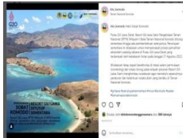
Figure 9 The first sample of the caption

through smartphones, the captions are written below Figures. If the Instagram account is accessed through computer/ laptop, the captions are available on the right side of the Figures. The followings are the captions of the above Figures.