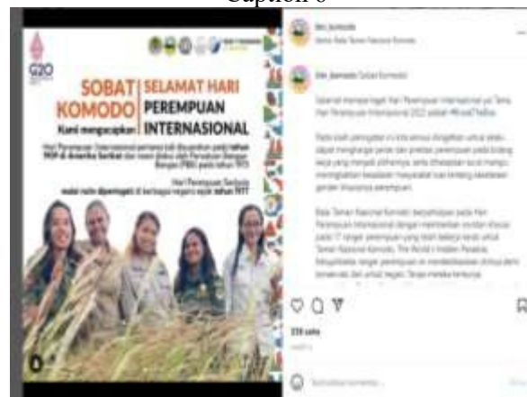
Figure 14 The sixth sample of the caption

Caption 6 expresses celebration of International Women's Day 2022 with hashtag #BreakTheBias. It is continued with recommendation for respecting women and regarding gender equality. To celebrate the day, Balai Taman Nasional gives special attetion to 17 women rangers who have worked hard in the institution. They have dedicated themselves for the conservation in this country: The World's Hidden Paradise.