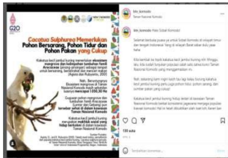
Figure 5 The fifth sample of visual image

which is the icon for celebrating Vesak day.