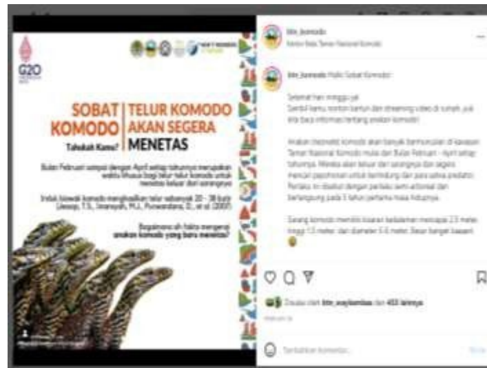
Figure 7 The seventh sample of visual image

Figure 7 displays the picture of some Komodo dragon's heads. The picture is completed with verbal texts which fill the half part of the page. The verbal elements contain information about the time of Komodo dragon's eggs hatch, the number of Komodo dragon's eggs, and closed with a question about newly born Komodo dragon. Besides, there are some logos of institutions and a logo of G20. The symbolic attribute of this Figure is the Komodo dragon's heads which represent their community in Taman Nasional Komodo.