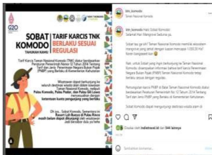
Figure 10 The second sample of the caption

Caption 1 is written in two paragraphs. The first paragraph contains information about an island Gili Lawa Darat and Resort Gili Lawa which are closed temporarily until next announcement. It is carried out to accelerate the recovery process of savanna in the island Gili Lawa Darat. The second paragraph provides information about alternative activities which can be done by tourists during the condition, by considering policy and regulation in Taman Nasional Komodo.