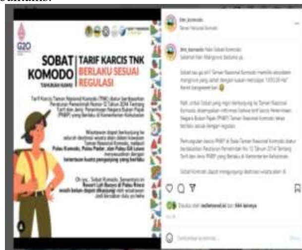
Figure 2 The second sample of visual image

Figure 1 shows a beach surrounded with land and mountains. There are also some logos of institutions, a logo of a community G20, and some verbal texts that give information about announcement for viewers that a place there, Resort Gili Lawa, is closed temporarily. The Figure dominantly shows a natural scenery on a beach without any participant who roles as an actor or a reactor. On the other hand, the verbal elements mention the name of a building around the beach, which is closed temporarily. It seems that the purpose of the verbal elements is to complete the Figure by providing more detailed information for the viewers. Symbolic attribute in this Figure is a beach which lays around lands and mountains.