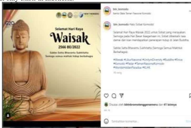
Figure 4 The fourth sample of visual image

Figure 3 shows the photo of a komodo dragon on the edge of a beach. There is also mountains around the beach. The komodo dragon is the dominant part of this picture. The Figure is accompanied with a text celebrating “World Oceans Day” on 8 June 2022. It is also completed with some logos of institutions and a logo of G20. The symbolic attribute of this Figure is a komodo dragon which is an iconic animal that only exists in Indonesia.