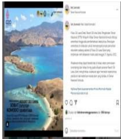
Figure 1 The first sample of visual image

The Figures posted on @btn_komodo contains different representations like event, participant, and setting. Most Figures are conceptual representations which symbolize what are represented. The followings are the selected Figures.