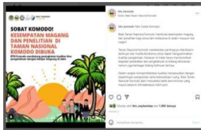
Figure 16 The eighth sample of the caption

Caption 8 gives detailed information that Balai Taman Nasional provides opportunities for students (domestics and foreigners) to have internship and research programs. The second paragraph emphasizes on scientific interdisciplines and multiculturalisme to optimize the quality of management. The last paragraph states that Balai Taman Nasional will conduct tight selection for proposals to maintain the quality of management.