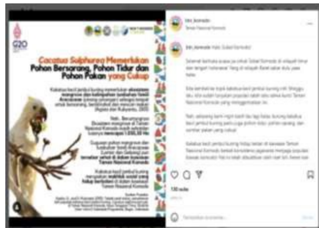
Figure 13 The fifth sample of the caption

Caption 5 is preceded with the expression of Happy Fast Breaking for moslem people. The second paragraph reminds the viewers about the main topic, that is Cacatua birds as one of the main animals who exist in Taman Nasional Komodo. The next paragraph talks about the Cacatua needs to be able to live there. The last paragraph states that based on the research, the existence of Cacatua is supported by the population of Komodo lizards.