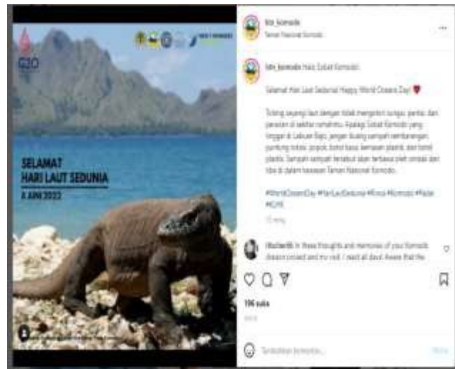
Figure 3 The third sample of visual image

addition to some logos of institutions and a logo of G20. The verbal elements contain information about the iprice of the ticket, the name of some destinations that can be visited by tourists, and the name of places which are still closed temporarily. It seems that the woman looks at the texts which represent the reactionary process. The Figure explains to the viewers that the visitors need to know the crucial information.