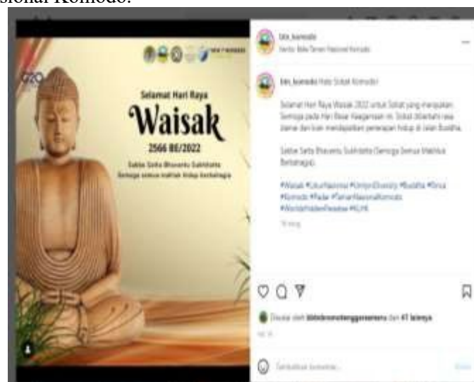
Figure 12 The fourth sample of the caption

Caption 3 contains expression of Happy World Oceans Day ended with red heart emoticon. The expression is completed with advice or request to maintain the cleanliness of the environment by not wasting rubbish into river, beach, or any other sanitations. Especially for the society who live in Labuan Bajo, it is strictly prohibited to waste rubbish improperly because the rubbish might come to the area of Taman Nasional Komodo.