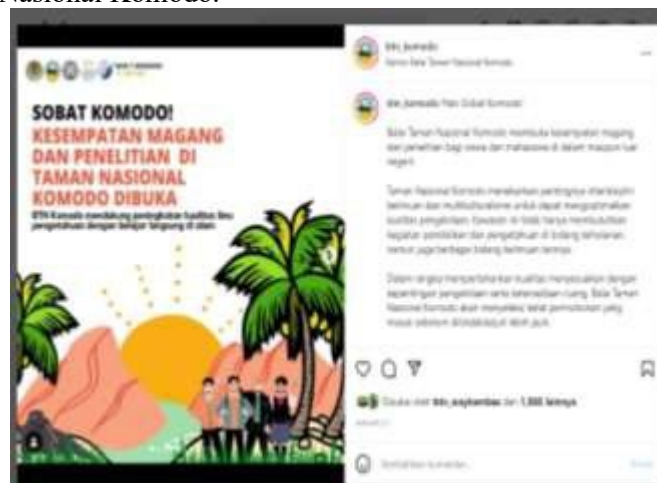
Figure 8 The eighth sample of visual image

Figure 7 displays the picture of some Komodo dragon's heads. The picture is completed with verbal texts which fill the half part of the page. The verbal elements contain information about the time of Komodo dragon's eggs hatch, the number of Komodo dragon's eggs, and closed with a question about newly born Komodo dragon. Besides, there are some logos of institutions and a logo of G20. The symbolic attribute of this Figure is the Komodo dragon's heads which represent their community in Taman Nasional Komodo.