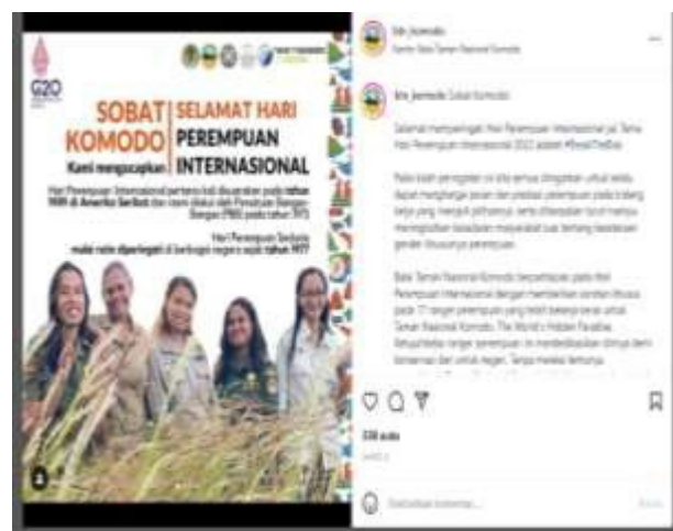
Figure 6 The sixth sample of visual image

Figure 5 displays a picture of a white bird, namely cacatua sulphurea perching on twigs. The picture is completed with verbal texts which fill the most part of the page. The verbal elements contain information about the ecosystem of the bird, the size and condition of the ecosystem, as well as the way the bird lives with its colony. Besides, there are some logos of institutions and a logo of G20. The symbolic attribute of this Figure is the cacatua bird which is one of animals that lives in Taman Nasional Komodo.